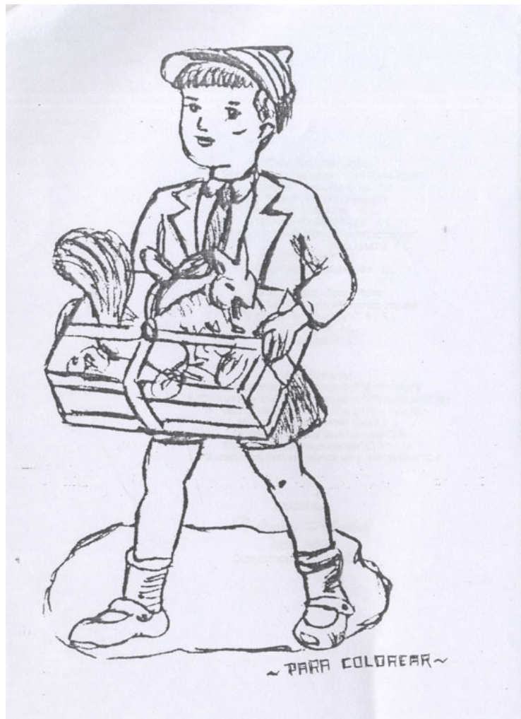
Fig 5. Pablo Pérez, El mendigo chupapijas , 1999, Number 5. To color.

If the resonance between the drawings and the trinket in Tatuada offers partial resolution to the story through materially and physically engaging its readers, El mendigo similarly invites the reader to literally color the novel's ending frame. Pablo, the story's protagonist, goes through a series of S/M sexual adventures in fairy tale fashion while searching for his true love. Transformation awaits him at the end of the text in the hands of a beggar whose kiss and touch trigger Pablo's male-to-female transition: he becomes Paula. The last illustration in the final installment of the text is larger in size than the others and includes the instruction para colorear (to color) at the bottom of the page (Fig. 5).