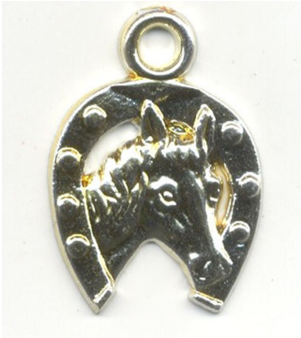
Fig 3. Tatuada para siempre , 1999, Dalia Rosetti. Golden plastic pendant.