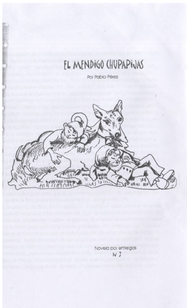
Fig 2. El mendigo chupapijas , 1999, Number 3, Pablo Pérez. Chapbook cover.

During the period that preceded and the years following the crisis, a sense of urgency led cultural workers to rethink the processes of literary writing, (self)editing and publication, consolidating what can be termed an “aesthetics of crisis”. Certain strategies which had emerged in the field of cultural production during the 90s would find in the 2001 crisis fertile ground to develop and thrive. 12 ByF, along with a number of independent presses which had seen the light in the late 90s, flourished during this period and facilitated the emergence of a fresh group of self-managed projects. ByF in particular became a key player in the underground literary world, subversively producing literature that was both financially and, with its flat, direct style, symbolically accessible, though not necessarily any less complex. 13